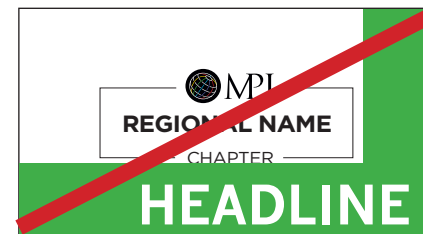
Do not violate the logo's clear space with any text or design elements.