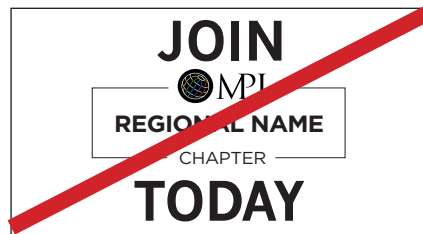
Do not create a "read-through" headline or message with the logo.