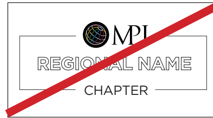
Do not outline any elements in the chapter logo.