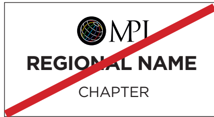
Do not remove any elements of the chapter logo.