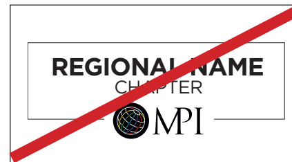
Do not alter the arrangement of the logo elements.