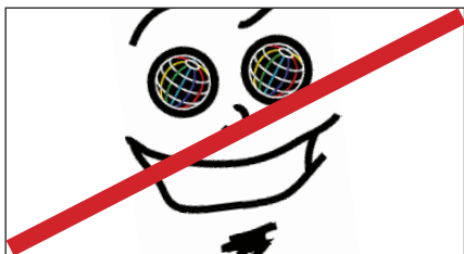
Do not use any individual element of the logo as a graphic design element.