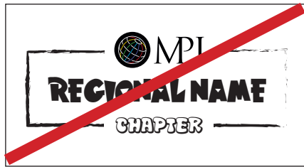
Do not redraw any element of the logo.