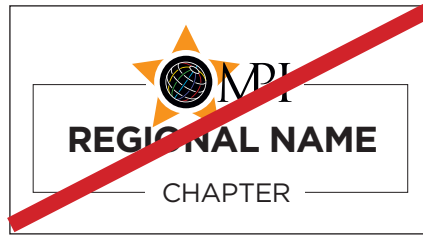
Do not add any elements to the logo.