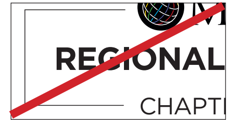
Do not crop the logo in any way.